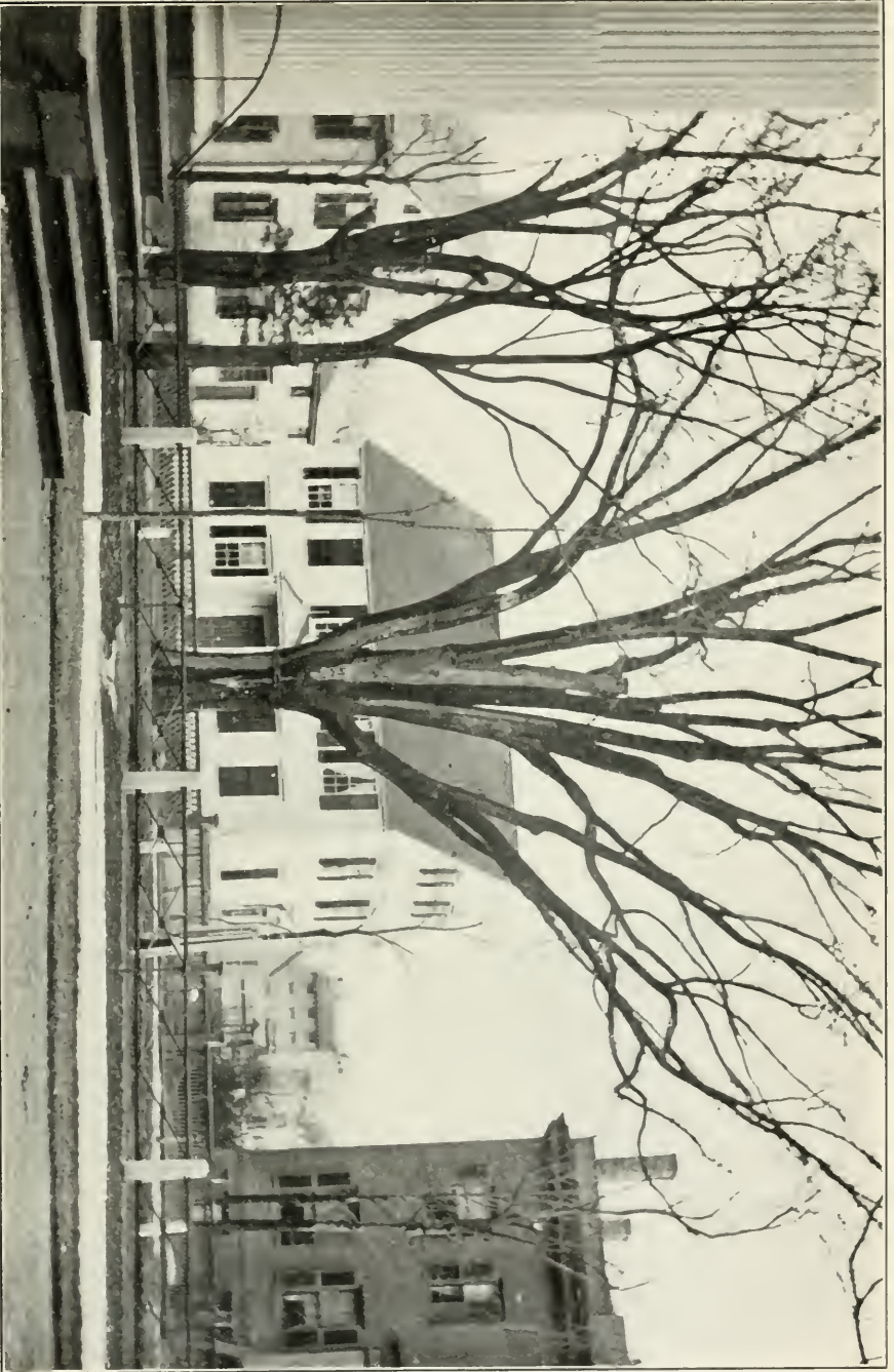
JOHN PIERPONT'S HOUSE IN NEW HAVEN. BUILT 1767.